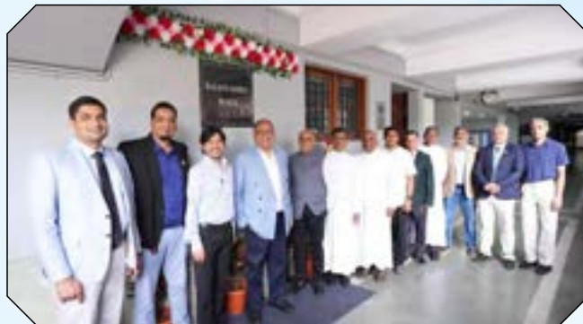
The plaque ceremony announcing the Razack Family Block