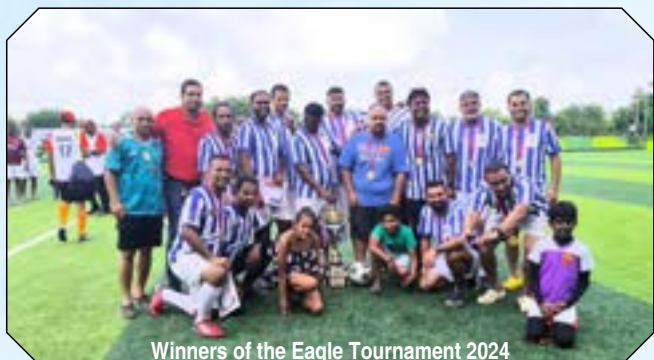
Winners of the Eagle Tournament 2024