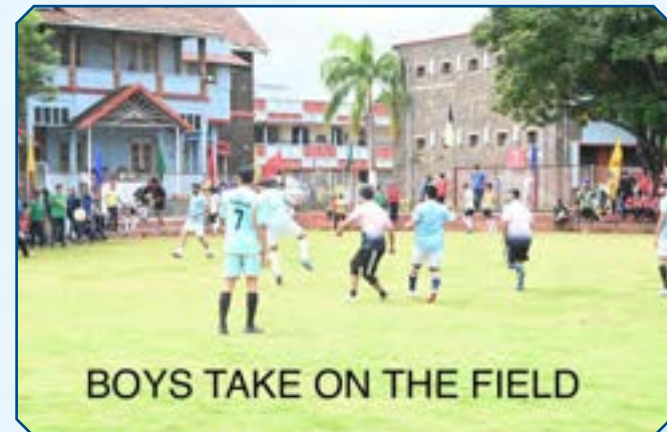
BOYS TAKE ON THE FIELD