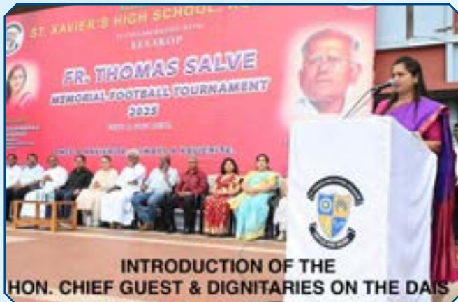
INTRODUCTION OF THE HON. CHIEF GUEST & DIGNITARIES ON THE Dais