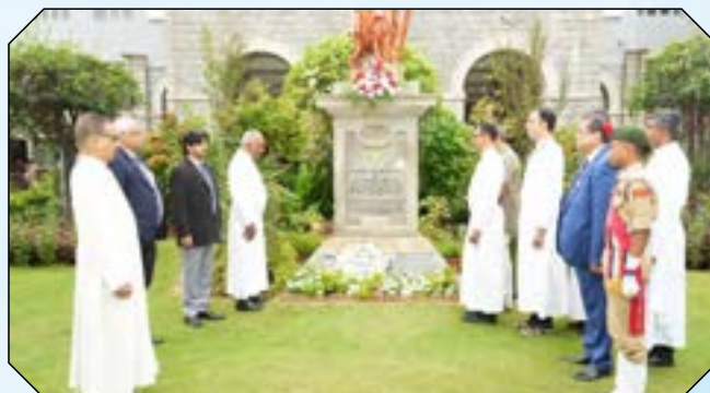
Laying of the wreath at the War Memorial