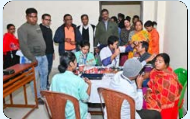
Medical Camp at Raghobpur Campus in January 2025