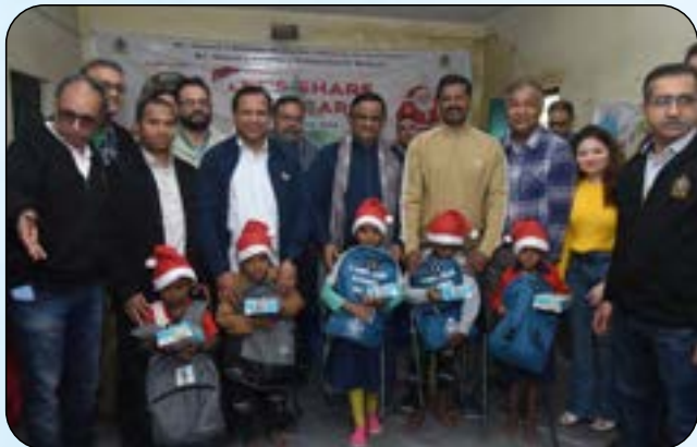
Share and Care