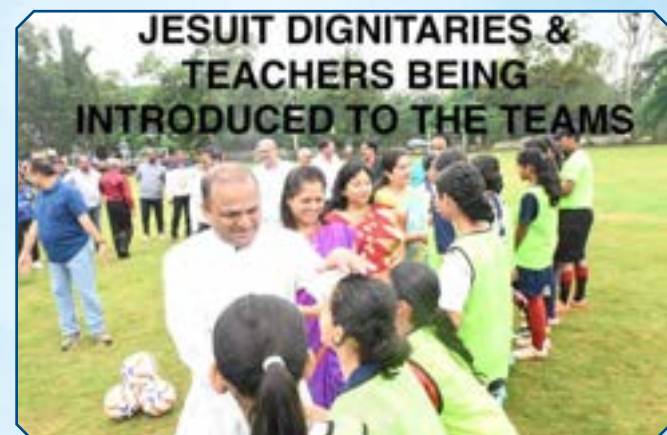
JESUIT DIGNITARIES & TEACHERS BEING INTRODUCED TO THE TEAMS