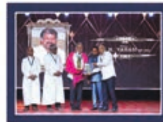
FRIENDS OF LOYOLA G.K. VASAN MEMBER OF PARLIAMENT