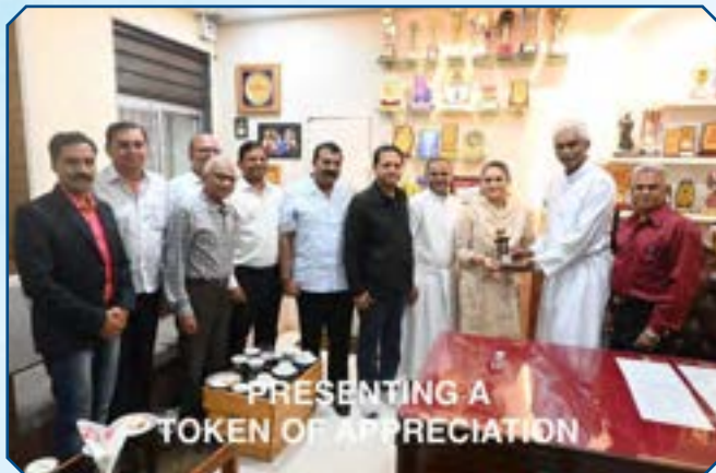
PRESENTING A TOKEN OF APPRECIATION

St. Xavier's High School, Kolhapur Pune Province