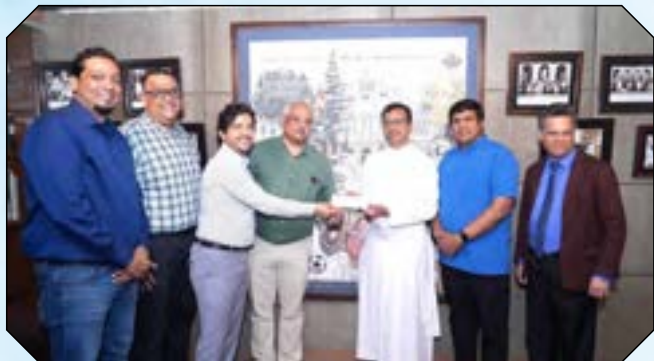
The OBA (Old Boys' Association) contributed INR 1.25 Crore to SJBHS

introduced as awards and presented to the winners at the OBA Buzz event. This initiative was implemented by the Management Committee based on feedback received from previous years.