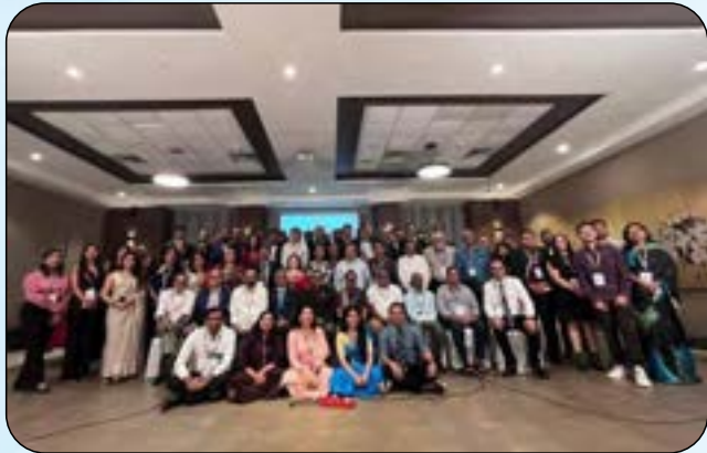
Launch of Deccan Chapter SXCCAA