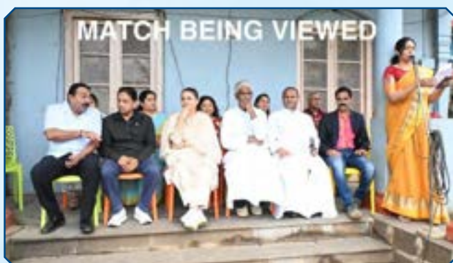
MATCH BEING VIEWED