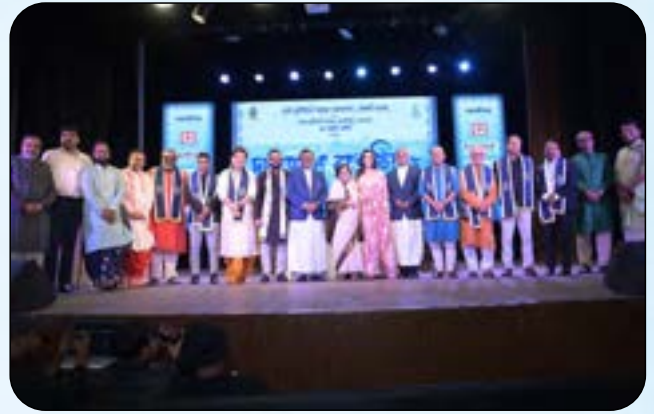
Dashobhuj Bangali 2025