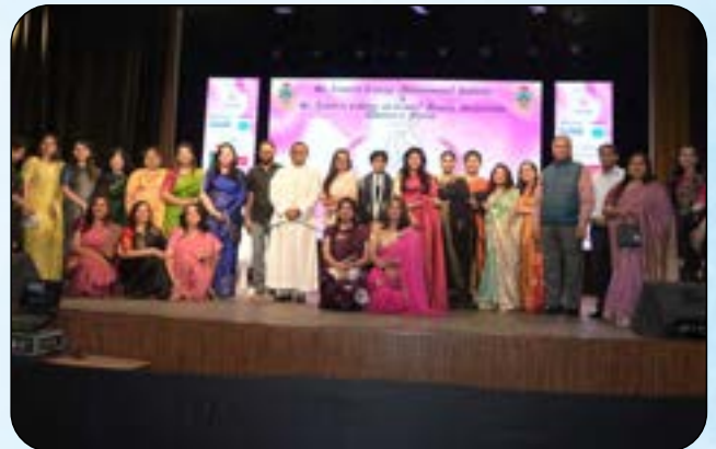
Women & Beyond 2025