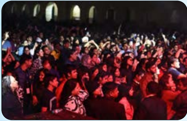
Beyond Barriers 2025