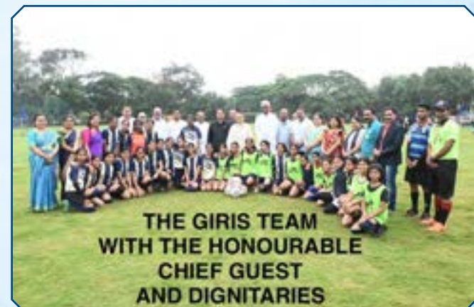
THE GIRIS TEAM WITH THE HONOURABLE CHIEF GUEST AND DIGNITARIES